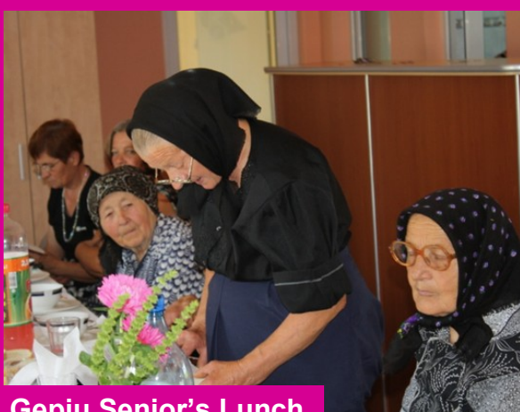
Gepiu Senior's Lunch