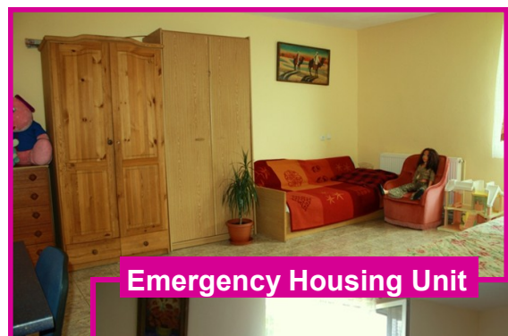
Emergency Housing Unit

In this state of despair, the mother and the girls arrived at our Emergency Housing Unit , able to benefit from all the advantages of being in a safe environment. The older girls were integrated in the local kindergarten, making new friends very quickly among the other children. Now, the mother can save money again, for a future home to rent or even, as she now dreams, to have a Smiles Container.